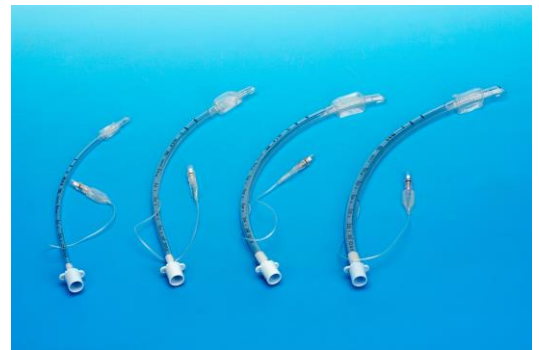
Cuffed and Non-Cuffed