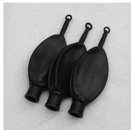
w/ bag line